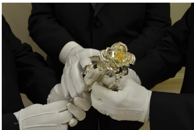
Silver Rose transferred from Assembly 2527 to Assembly 2302 during its journey through Alabama. Scheduling for 2013 has begun.

For more photos of the Silver Rose as it traveled through our Great State of Alabama go to: https://picasaweb.google.com/sgrif172/SilverRose?authkey=Gv1sRgCNaHgeS8oYjcwWE